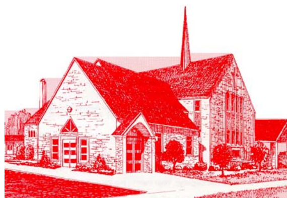
Christian Reformed Church, Baldwin