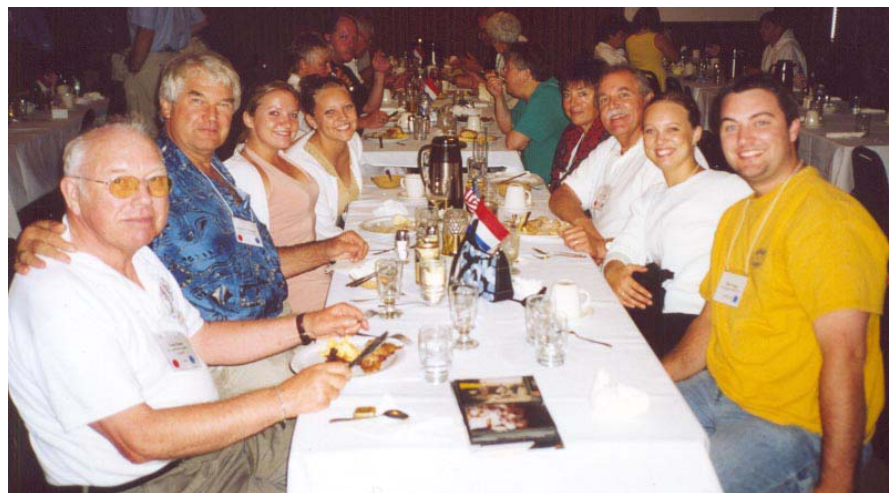
A happy family with coffee and cake