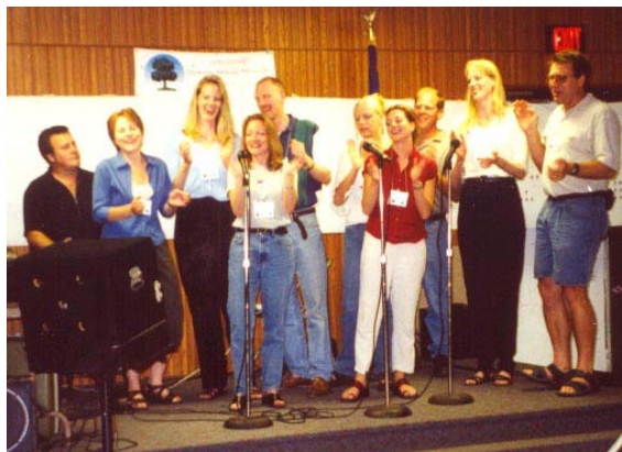
Saturday evening: Karaoke singers

and bad duets, good solos, popular songs, and old favorites.