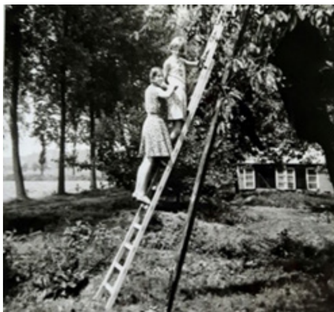
Anja and Rinia cherry-picking.

We had our own vegetable garden that was taken care of by our grandparents where all kinds of vegetables were grown. It was pure organic vegetable gardening with no pesticides or fertilizers. The love for the farm lay in a small orchard with old-fashioned fruit varieties. There