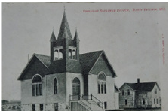
Christian Reformed Church