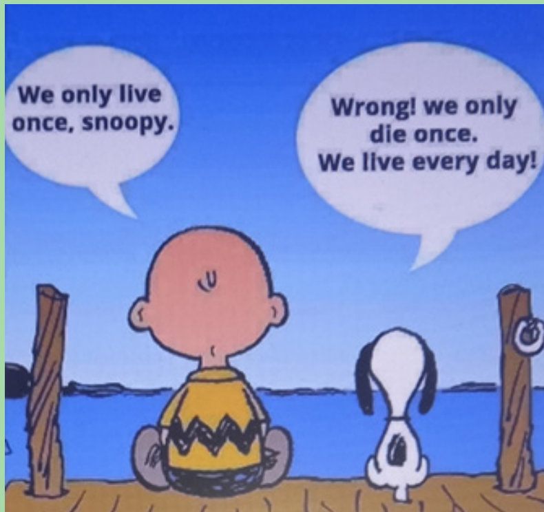
Charlie Brown & Snoopy

We wish you a merry, pleasant, blessed and merry Christmas!