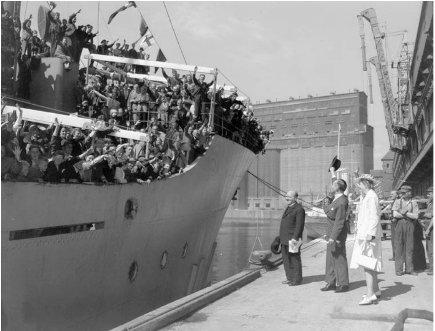
The Dutch ambassador, Dr. J.H. Van Roijen, waves to his fellow citizens as De Waterman docks in Montreal.

equipment itself or for the need for steel in the armaments supply. The following 2 years saw little relief from this loss with only a small amount of importing equipment being possible due to all countries working to recover from the war losses.