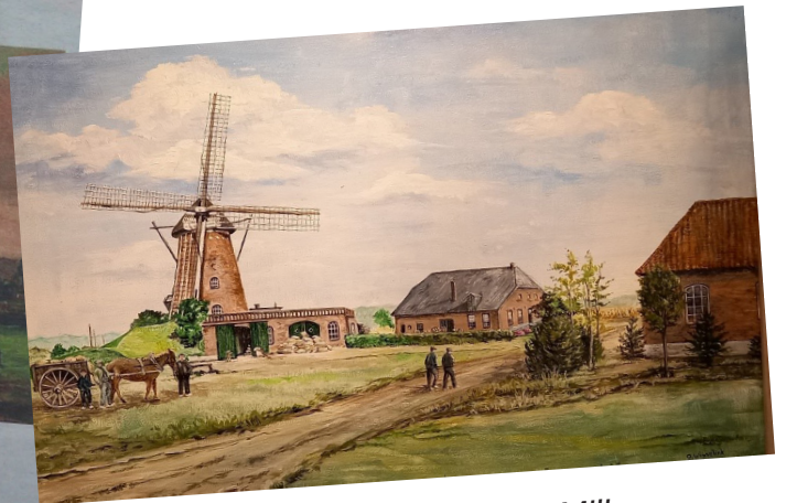
Gerda Wisselink – Coops Mill

Press release exhibition 26-06 to 21-09-2024