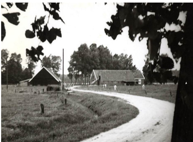
Via a dirt road you arrived at 'De Snieder'.

On Saturdays we had to do chores as children and our weekly wash was also done. When I was a child, we didn't have a shower. Mother washed us in a large zinc basin. Around 1960, De Snieder was an average, mixed agricultural company with more than 13 hectares of arable and grassland, 10 dairy cows with accompanying young stock, a workhorse, a few sows with piglets, about 25 fattening pigs and about a hundred chickens. The season, nature, and the weather determined the nature and rhythm of the farm's work throughout the year.