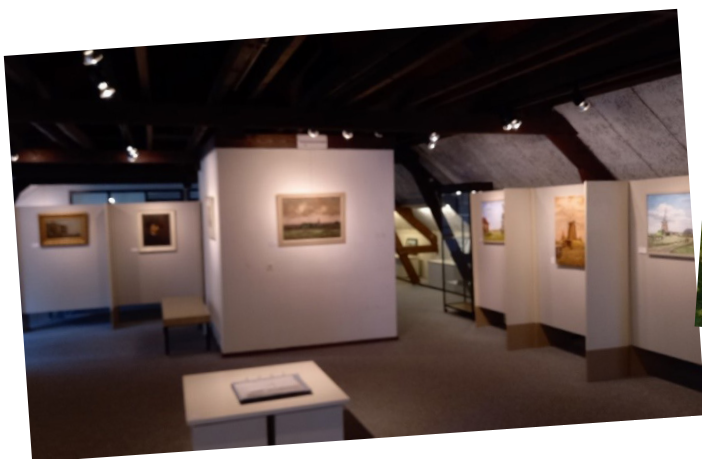
Exhibition Library Zelhem

Press release exhibition 26-06 to 21-09-2024