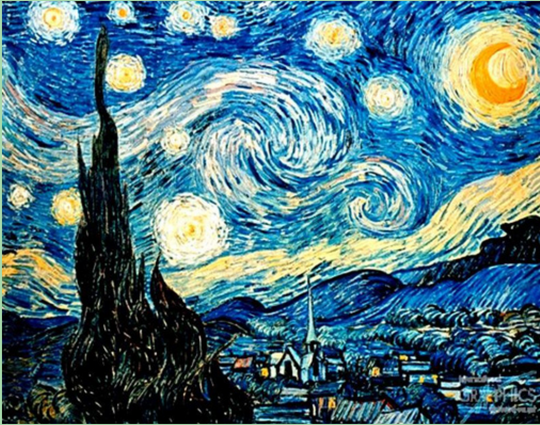
Vincent van Gogh – Sterrennacht / Starry Night

We wish you a merry, pleasant, blessed and merry Christmas!