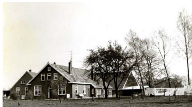
The laundry hangs on the clothesline at 'De Snieder' 1965.

Grandpa Somsen was a quiet, contemplative man. He was economical by nature, the light could not be turned on too quickly in the evening and had to be turned off immediately when you left a room. He always called us