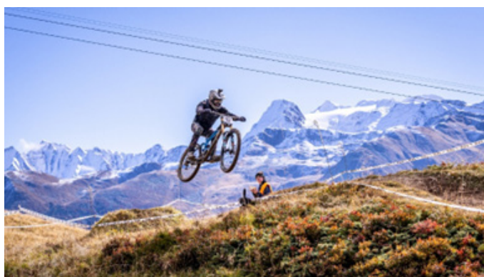
Snow-capped peaks during run in the Swiss alps.

Another highlight was the MTB Downhill European Championship in Champéry, Switzerland. Again, an insanely beautiful location in the Alps. We had beautiful weather,