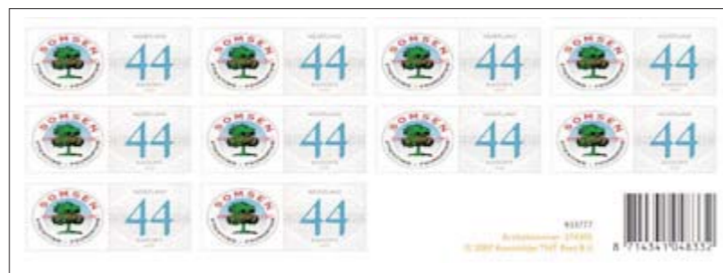
The Somsen foundation stamps

The American supporters of the Somsen Foundation can order them at Mrs Marieke Edwards, 920 East Bay Dr. NE#3D301 Olympia, WA 98506-1222. A sheet of 10 44-eurocent stamps is $ 9. Now we also have self-adhesive stamps which can be supplied in sheets of 50 for the price of $ 45,00. The stamps will be posted after your payment has been received. Please do not forget your name and address.