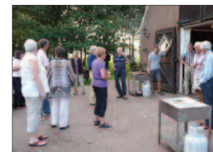
Somsens at the outdoor café of the campsite 't Hoftijzer