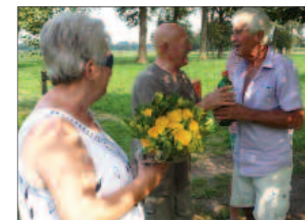
Presentation of flowers and bottle