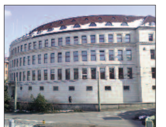
Right: Erasmus Hochschule