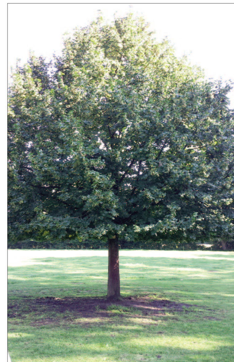
The Somsentree in IJzerlo